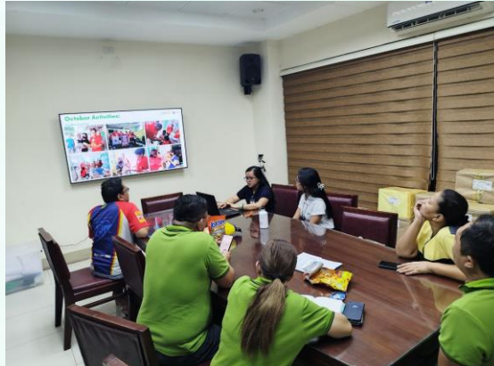
7th Club Meeting and Fellowship