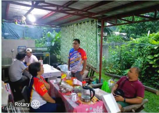
6th Club Meeting and Fellowship