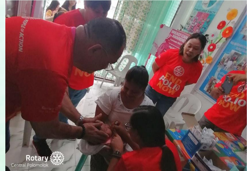
Patak to End Polio Vaccinated babies to eradicate polio