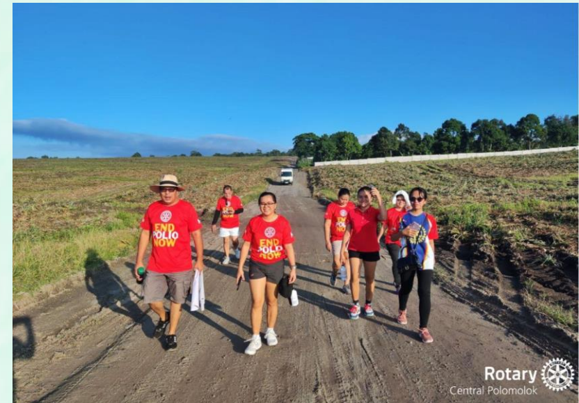
Walk to End Polio – Awareness campaign to end polio