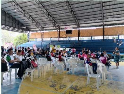
Pink October - Breast Cancer Awareness Campaign