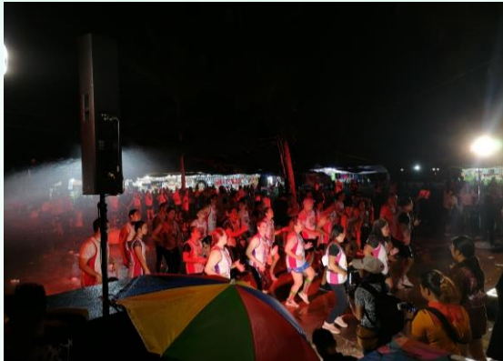
Supporting our Mother Club on their Color Me Fun Event at Koronadal